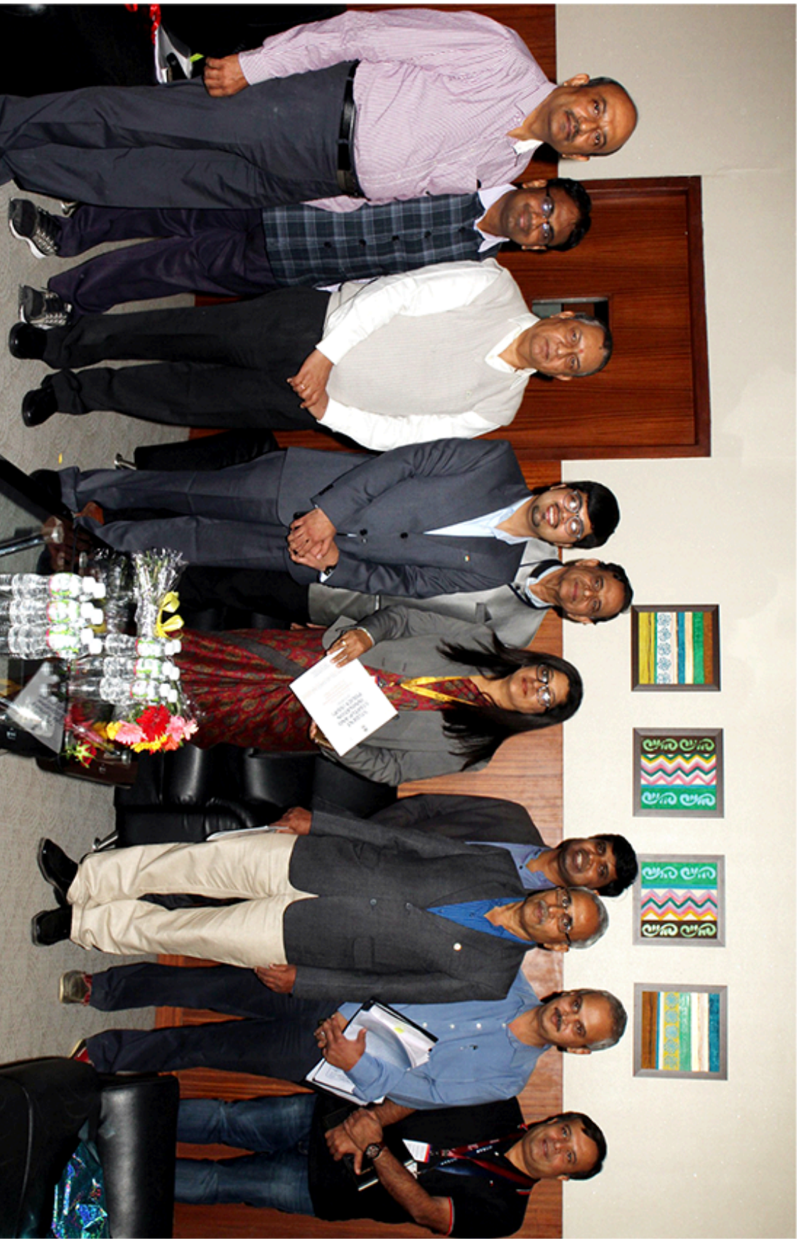
Members of the policy drafting committee along with other officials of the Education Department, Government of Gujarat, at Mahatma Mandir on January 8, 2017, following the unveiling of the Student Startup and Innovation Policy