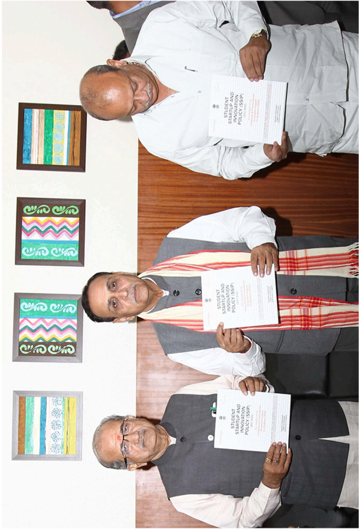
Hon'ble Chief Minister, Shri Vijay Rupani, Hon'ble Minister of Education, Shri Bhupendrasinh Chudasama, and Hon'ble Minister of State for Education, Shri Jaydrathsinh Parmar, unveiling the Student Startup and Innovation Policy at Mahatma Mandir, Gandhinagar, on January 8, 2017.