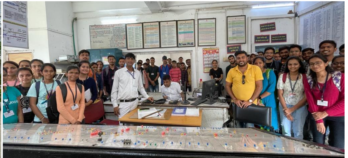
Control system of Railway station, Valsad