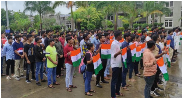
Students and faculty gather for the Har Ghar Tiranga rally