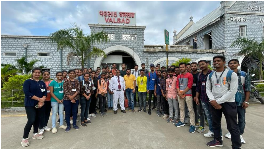
Visit to Railway station, Valsad