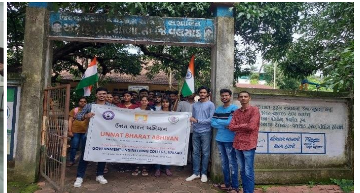
Har Ghar Tiranga rally at Atar Village