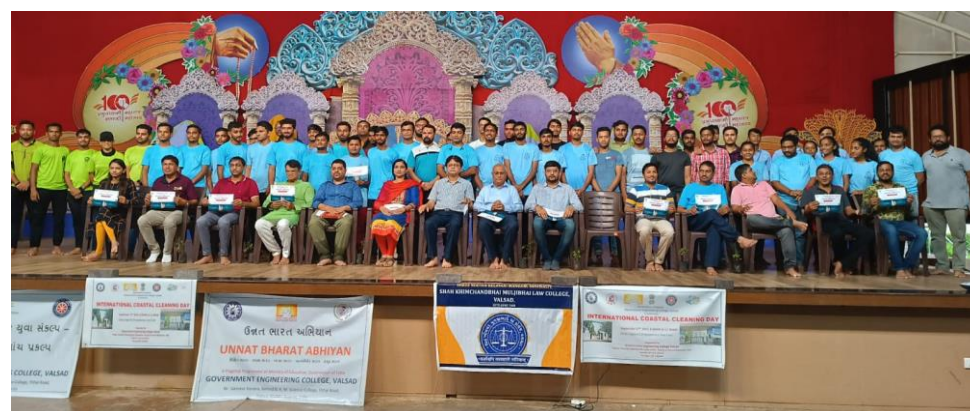
Group photo with invited guests, NGO and Students volunteers