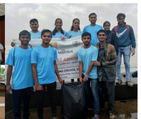
Students with waste collection