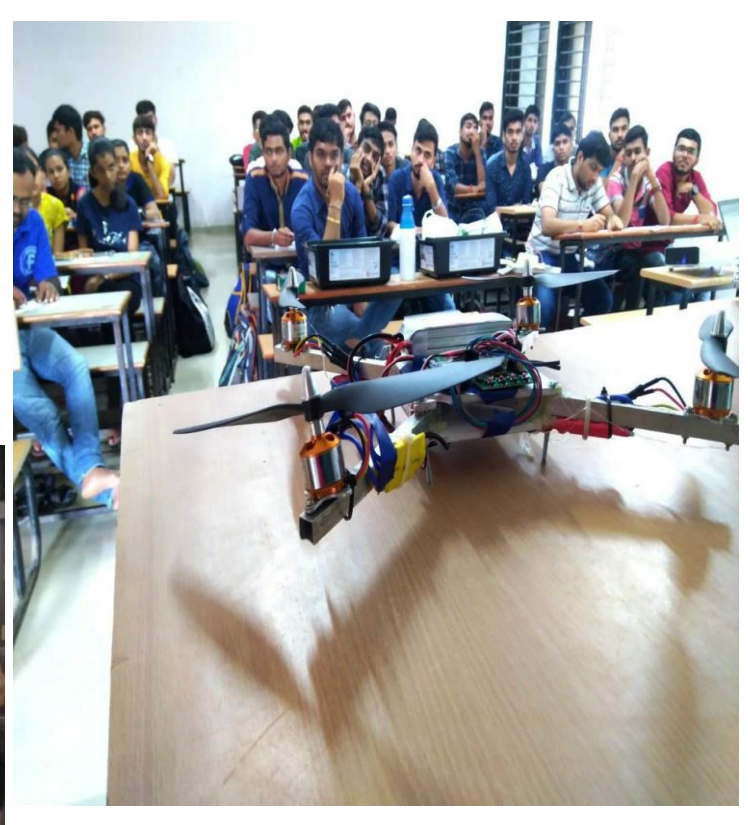
Demonstration of applications of controllers